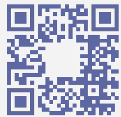
Readings in English

Next Sunday: Dt 4:32-34, 39-40/Ps 33:4-5, 6, 9, 18-19, 20, 22 (12b)/Rom 8:14-17/ Mt 28:16-2