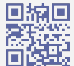
Readings in Spanish